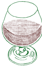
REVOLVER 12. Rye whiskey, Kahlua, Regan's orange bitters, flamed orange peel