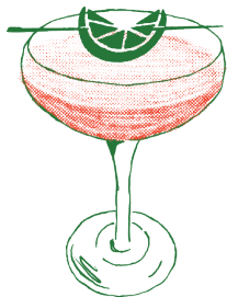
COSMOS 15. Herradura Silver, Cointreau, Ocean Spray, lime