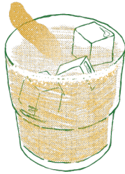
GINGER 10. El Jimador blanco, spicy ginger syrup, fresh lime