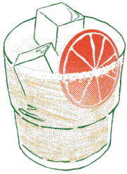
BLOOD ORANGE 14. Lunazul Reposado, Solerno Blood Orange, Ancho Reyes, lime, orange