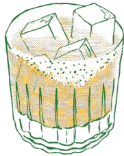
TOP SHELF 18. Herradura Ultra, Stirrings triple sec, fresh lime