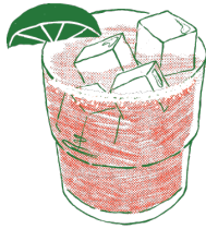
THE FRIDA 13. Del Maguey Vida mezcal, Ancho Reyes, hibiscus-morita syrup, lime juice