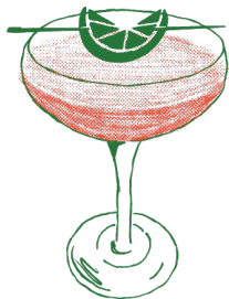
COSMOS 15. Herradura Silver, Cointreau, Ocean Spray, lime