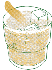
GINGER 10. El Jimador blanco, spicy ginger syrup, fresh lime