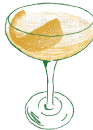
UNDER THE VOLCANO 12. Mezcal, grapefruit, lime, Luxardo Maraschino, habanero