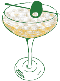
SUPERITA! 18. Ocho Plata, Combier, fresh lime and orange, citrus marinated olives, up