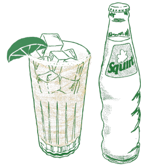
LA PALOMA 12. El Jimador blanco, lime, glass bottle Squirt, salt rim