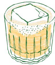
TOP SHELF 18. Herradura Ultra, Stirrings triple sec, fresh lime