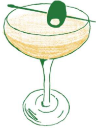
SUPERITA! 18. Corazon Reposado - Weller barrel, Combier, fresh lime and orange, citrus marinated olives, up