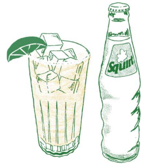
LA PALOMA 14. El Jimador blanco, lime, glass bottle Squirt, salt rim