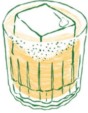
TOP SHELF 18. Herradura Ultra, Stirrings triple sec, fresh lime