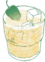
JALAPEÑO 15. Tanteo Jalapeño, Ancho Reyes Verde, Stirrings triple sec, fresh lime