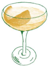
Fancy MARTINI OAXACA 15. Las Californias Nativo gin, Bosscal Damiana mezcal, Dolin Blanc