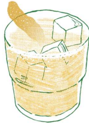
GINGER 10. El Jimador blanco, spicy ginger syrup, fresh lime