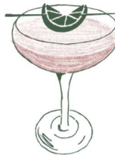
COSMOS 15. A tequila Cosmopolitan with Herradura Silver, Cointreau, Ocean Spray and lime